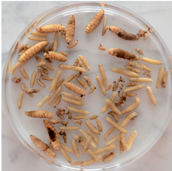
Fig. 2. Larvae of W. magnifica at different instars removed from the preputial region