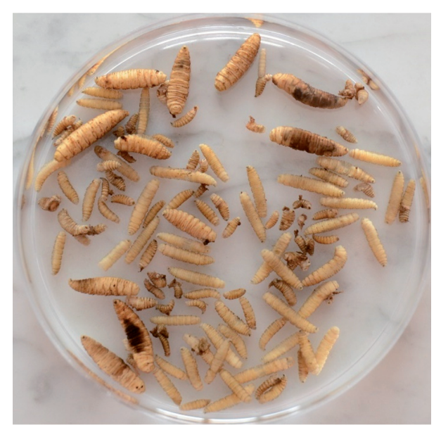
Fig. 2. Larvae of W. magnifica at different instars removed from the preputial region