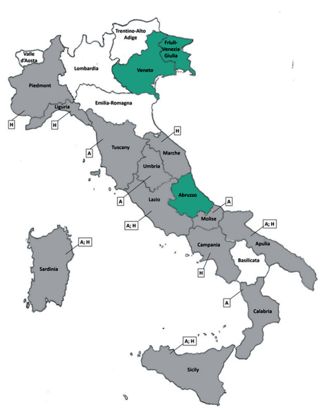
Fig. 3. Map of Italian administrative regions showing where human and animal cases of myiasis caused by W. magnifica were reported (grey) and where only individuals of this species were collected (green). Abbreviations: A, animal myiasis; H, human myiasis