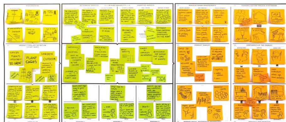
Figure 4. Computational Concept Canvas, completed. Different colour post-its show the three main blocks of the canvas, better explained on the next page. Note that also various smaller versions have been elaborated, as explained later.

Module B is the key part of the work, which helps to define the Personalization principle to follow. This starts by B1 evaluating the relevance of the previously mentioned six personalization principles; then B2 constructing personas that represent potential users and their personalization need; and finally B3 identifying design opportunities between the previous elements of the module.