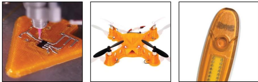
Figure 3. Electronic circuits in 3D printing, from left to right: (a) Voxel8’s experimental technology, printing conductive metallic traces over FDM printed plastic; (b) Voxel8’s demo object, a complex electro-mechanical system (mini-drone) featuring directly printed electric cabling and standard components; (c) NanoDimension’s demo object, a body thermometer demonstrating the possibility of printing fine, highly detailed objects with integrated electronic traces in UV-curable resin, on an inkjet-style printer.

components, open design for distributed production should encourage better constructions and design for disassembly, promoting circular economy and reducing e-waste. Security, however, should be an important concern. Today we are used to every appliance in commerce being complaint to standards, otherwise manufacturers would face severe consequences. As Phillips et al. (2016) argue, the proliferation Open Design pose a risk to the “trustworthiness” of the current material culture, therefore some form of standardization should be re-introduced even into on-demand manufacturing.