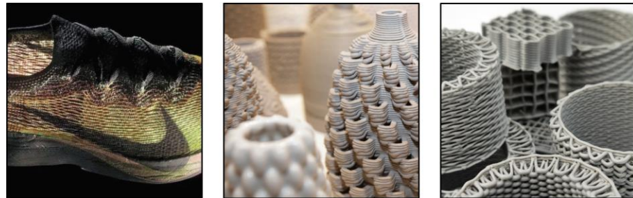
Figure 2. 3D printed microstructures for filament-style extrusion, samples, from left to right: (a) Nike Flyknit shoe upper, obtained by the FDM printing on the flat printing bed. (b) clay extrusion printing with the direct control of g-code, by Ronald Rael and Virginia San Fratello (c) experimental soft plastic structures specially developed for FDM 3D printing, by the author.

The issue of software tools is an important one for designing with microstructures; as Vidimce et al. (2013) or Li et al. (2018) argue, the now mainstream explicit modelling of NURBS or mesh surfaces is not very suitable for additive manufacturing. Implicit modelling allows the efficient modelling and simulation of internal structures using “field-driven design”, leveraging the modern GPUs, transforming the mathematical representation of the substance into Additive Manufacturing files without converting the microstructures into mesh. A powerful example is the proprietary nTopology Platform, while a simpler, free and open-source implementation is ImplicitCAD(.org).