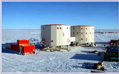
Fig. 3. The two main buildings of the Concordia permanent station at Dome C (3280m a.s.l.) on the Antarctica Plateau, as appear at the end of the last summer expedition.

mid-infrared observations do the possibility to derive direct information on the spatial structure and symmetry of the circumstellar envelopes.