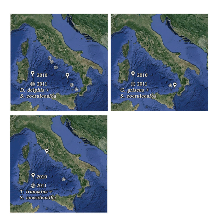
Fig. 3: Sightings of mixed groups.

observed, while all the other species were sighted in the regions with high frequency.