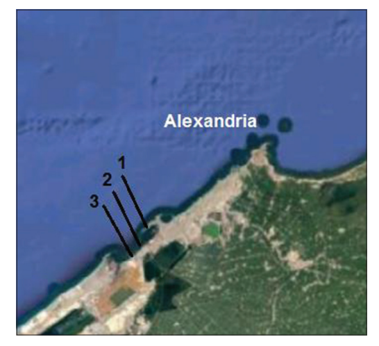
Fig 1: Sampling sites from Alexandria (Egypt): 1, Bahary; 2, El-Shatby and 3, El-Max.

Samples were collected from different points of Alexandria shore: El-Max, Bahary and El-Shatby (Fig. 1) and then transferred to the Biotechnology and Biodiversity Conservation laboratory, Centre of Excellence for Advanced Sciences, National Research Centre. Sampled fish were dissected, barcoded following Di Finizio et al., (2007) and the tissues (gills, liver and muscle) aliquoted from 30 fishes of each species/sites were used for analyses. White sea bream ( Diplodus sargus ) and sardine ( Sardine pilchardus ) were collected from El-Max and Bahary while sardine was sampled from El-Shatby that may be considered as a reference point.